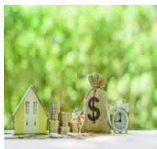
State of Maryland Homeowner Assistance